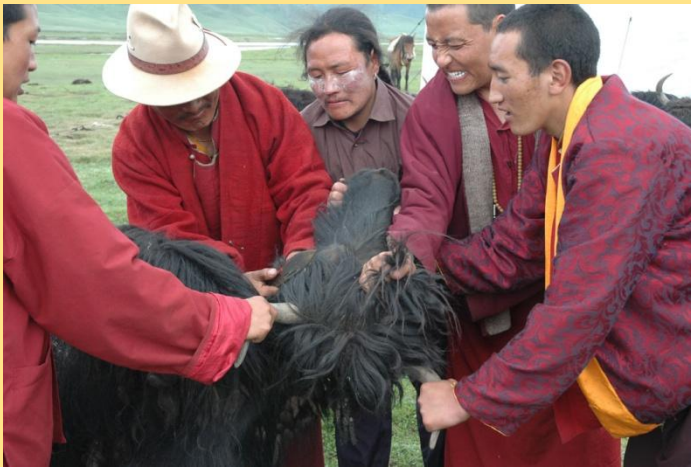
Tagging the yak herd as "never-to-be-slaughtered."

However, within five days of the quake, with your help, a team from Kilung Foundation fed 2,000 people with local, nourishing, Tibetan food for 12 days; and the first delivery of food provided by our yak herd reached the town in September, nourishing 30 Kyegu families in extreme need.